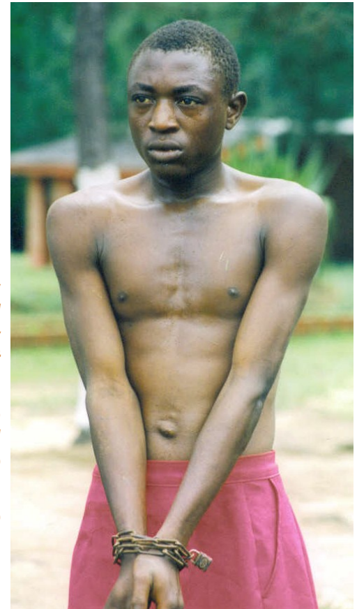
Challenging Human Rights Abuses