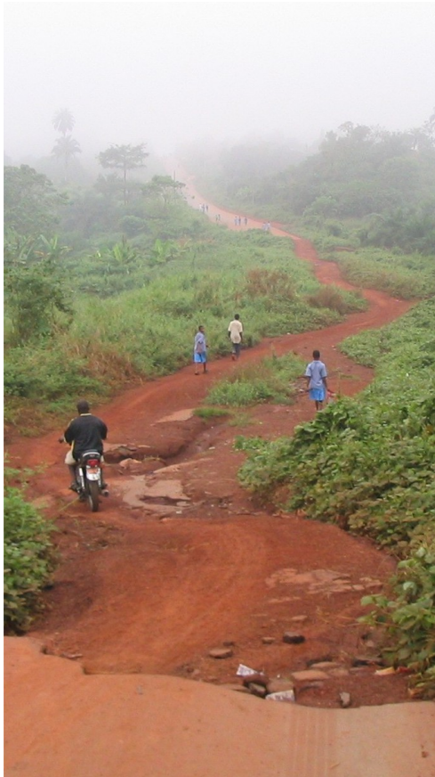
The road to Amaudo