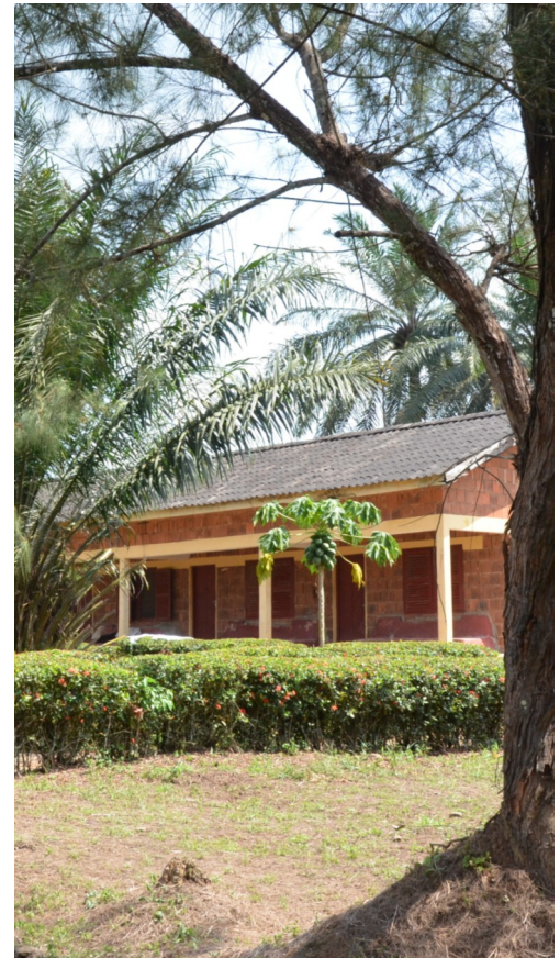
House at Amaudo

“The reroofing of 5 residential houses has been completed and the houses have become stronger and more conducive for living. They have been saved from dilapidation and perhaps collapse. The houses also have better value now. We are very thankful to Amaudo UK and all who donated funds for this project.”