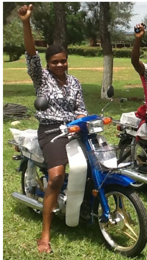
New bikes for Project Comfort

"I am highly motivated by the allocation of a new motorcycle for my fieldwork because I can now keep up with the appointments for clients and their families, unlike before when the old motorcycle would develop a fault on the road thereby resulting in the delay or cancellation of an appointment. I have also saved money from frequent repairs of old motorcycle as I now do not visit the mechanic unless the servicing is due. The new motorcycle has raised the confidence of the clients' families and the society in me because when I used the old motorcycle to visit my clients they seemed worried because of our inability to purchase a good motorcycle which made them not believe that my services could be of help to them. I am happy because more children with disabilities are seen and supported every day. Many thanks to Amaudo UK ."