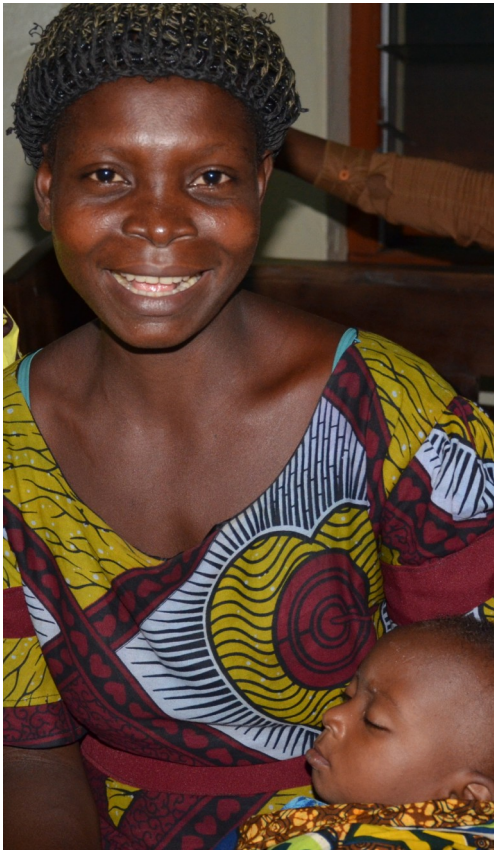
Family member celebrating repatriation